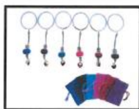
Beaded Key Ring $3