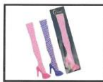
Jumbo Nail File $1