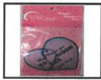
Air Freshener $1