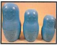
Measuring Cups $5