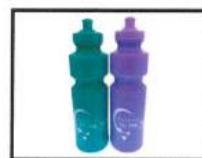
Drink Bottle $4