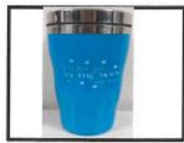
Travel Mug $5

Limit of 2 gifts per student. Siblings please speak to each other to make sure Mum doesn't get the same gifts. Cards are available for year 1-6 students.