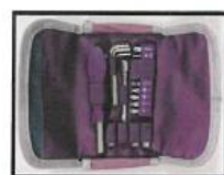
Tool Kit $5