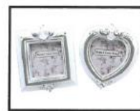
Antique Frame $3