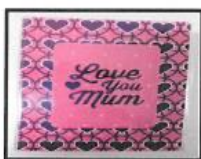
Magnetic Frame $2