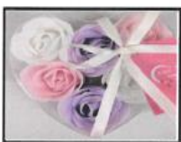
Rose Soap pk 6 $3