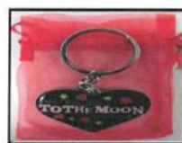
I love you' key ring $2